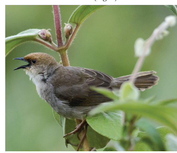
Figure 1. Chubb's Cisticola (photo: N. Baker).

Kabanga close to the Rwandan border from September 1992 (NEB, EMB), and one from the Rovuvu River where it forms the boundary between Tanzania and Burundi, on 29 September 1992 (ZB). There is also a more recent record from the Rwandan side of Rusumo Falls on 13 December 2009 (JA). Haldane (1951) did not record any cisticolas in his three years' residence, not even Trilling C. woosnami .