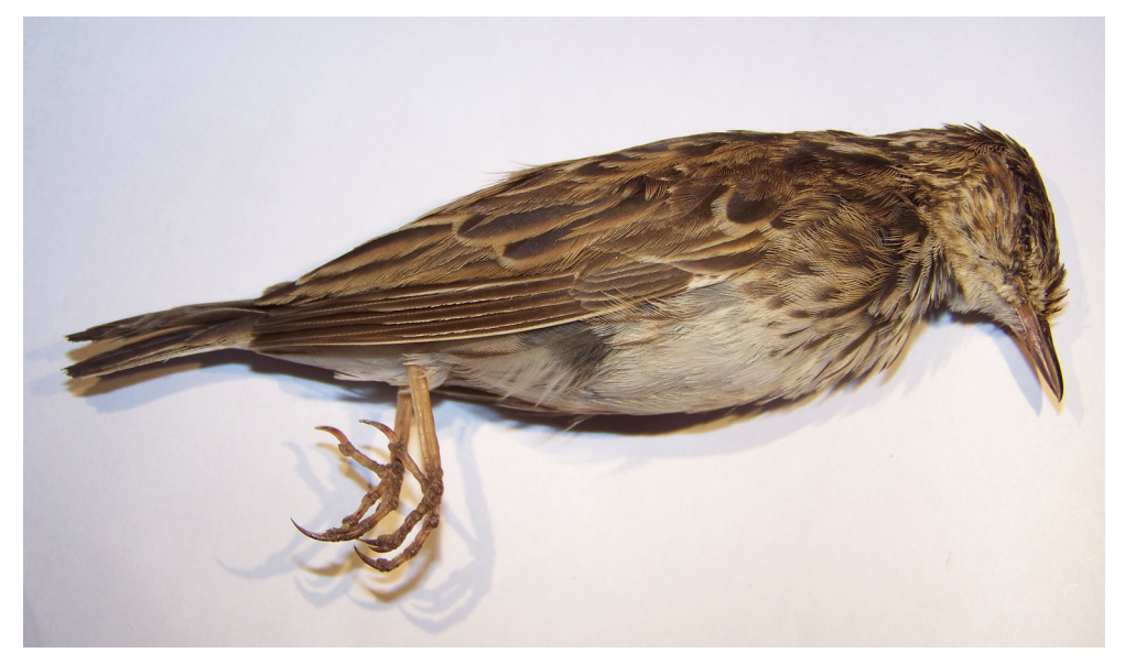
Figure 3. Photograph of Bush Pipit collected at Mpala Research Centre.