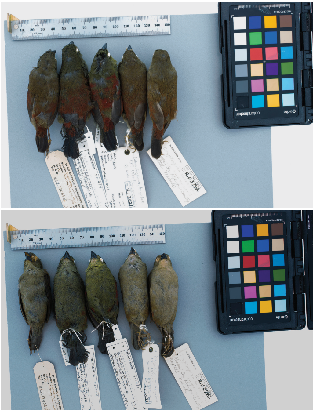
Figure 4. Comparative dorsal (top) and ventral (bottom) views of juvenile / immature specimens of Red-faced Crimsonwing Cryptospiza reichenovii australis and Abyssinian Crimsonwing C. salvadorii of both sexes, including the Lovridge specimen from the Uluguru Mountains described in Friedmann & Lovridge (1937). Specimens (left to right) as follows: C. r. australis (female, 'Mbeta' = Mgeta, Uluguru Mountains, Tanzania, leg. A. Loveridge, 24 July 1922, MCZ 134085); C. r. australis (male, Mt. Gorongosa, Mozambique, leg. S. Reddy, 20 August 2011, FMNH 481454); C. r. australis (female, Mt. Gorongosa, Mozambique, leg. C. Salema, 15 August 2011, FMNH 481450); C. r. australis (male, Dabaga Highlands, Iringa, Tanzania, leg. J. G. Williams, 26 March 1952, FMNH 217021); C. salvadorii ruwenzori (female, Nairobi, Kikuyu, Kenya, leg. V. G. L. van Someren, 24 May 1918, FMNH 203742) (N. J. Cordeiro)