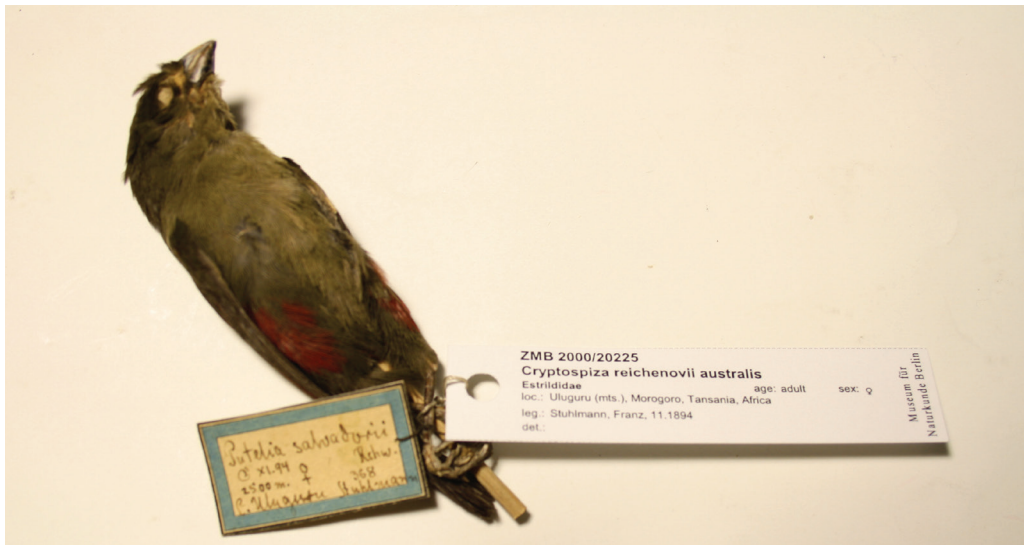
Figure 2. The female Cryptospiza specimen collected by F. Stuhlmann in October 1894 at 2,500 m in the Uluguru Mountains, Tanzania, initially identified as Abyssinian Crimsonwing C. salvadorii (presumably by A. Reichenow) and now correctly identified as Red-faced Crimsonwing C. reichenovii australis , Museum für Naturkunde, Berlin

Birds of Africa (Keith 2004) reported the ranges of wing and tail measurements, respectively, for females of C. salvadorii kilimensis (wing 56–58 mm, mean = 57.0 mm; tail 40–44 mm, mean = 41.9 mm) and C. r. reichenovii (wing 52–57 mm, mean = 53.9 mm; tail 36–41 mm, mean = 39.4 mm). As such data were not provided for C. r. australis , the race in the Eastern Arc Mountains to Malawi and Mozambique (Britton 1980, Keith 2004), we measured seven females of C. r. australis from Malawi, Mozambique and the Uluguru Mountains from the FMNH series. One Uluguru adult female (MCZ 134084) measured 54 and 39 mm for wing and tail, whereas the juvenile female (MCZ 134085) correspondingly measured 50 and 41 mm, respectively. Wing and tail measurements of C. r. australis were 52–56 (mean = 54.9) and 36–40 (mean = 39.2) mm, respectively. Comparing these measurements places the adult MCZ specimen within the range of C. reichenovii rather than C. salvadorii .